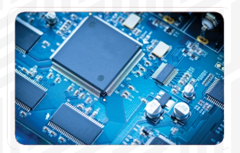
V-MAP current controlled source with true real time 100KHz linear regulated power source.